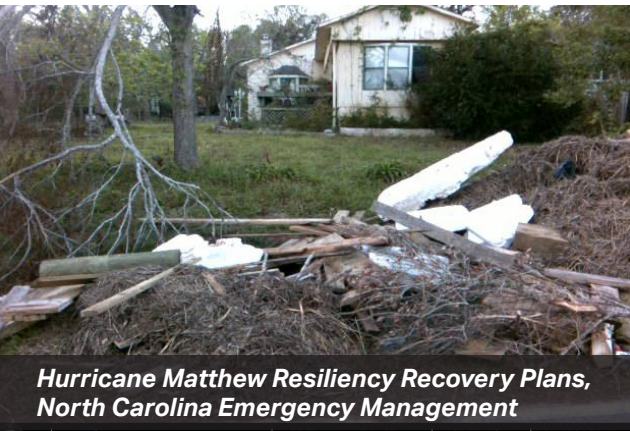
Hurricane Matthew Resiliency Recovery Plans, North Carolina Emergency Management

AECOM developed 25 plans for individual counties to assess impacts on housing, economic development, infrastructure, and environment, and to create viable strategies to mitigate the impacts of future dramatic climate change.