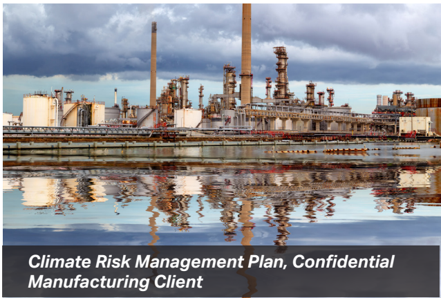
Climate Risk Management Plan, Confidential Manufacturing Client

Fulfilled the requirements of Executive Order 569 by developing a climate adaptation plan that outlines a statewide strategy to address climate change impacts through adaptation and resiliency measures and policies.