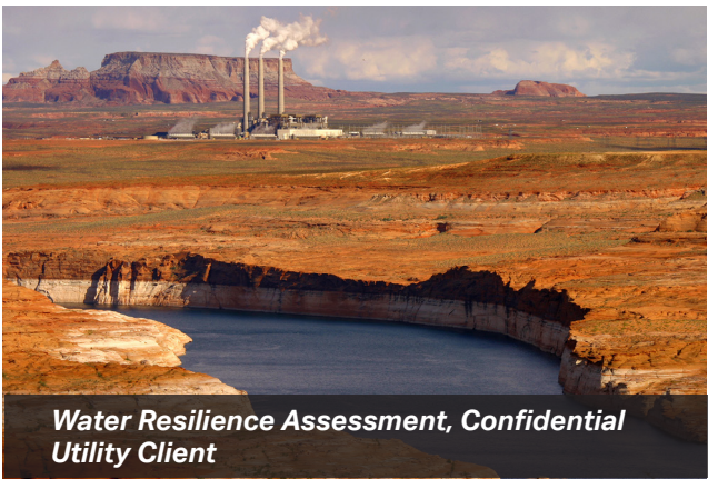
Water Resilience Assessment, Confidential Utility Client

AECOM is producing a Climate Risk Management Plan for a high tech manufacturer, which includes an assessment of climate risk at a portfolio of key facilities. In addition to identifying site vulnerabilities and potential impacts and risks to operations, the assessment will detail specific recommendations for adaptation actions that can be taken at the corporate and facility levels.