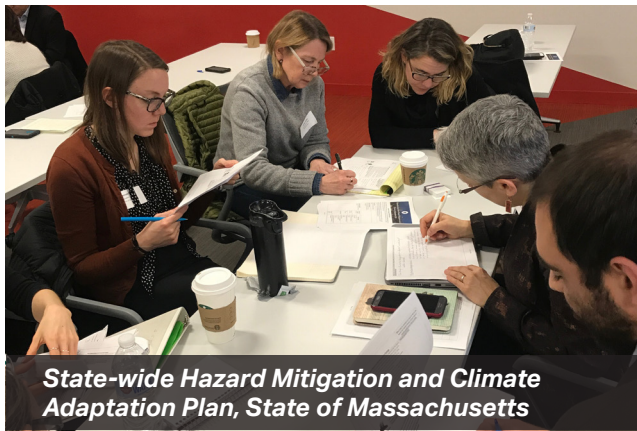
State-wide Hazard Mitigation and Climate Adaptation Plan, State of Massachusetts

AECOM developed 25 plans for individual counties to assess impacts on housing, economic development, infrastructure, and environment, and to create viable strategies to mitigate the impacts of future dramatic climate change.