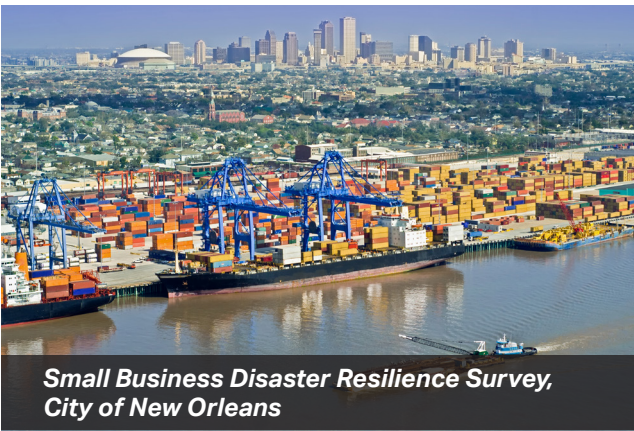
Small Business Disaster Resilience Survey, City of New Orleans

AECOM developed a water resilience assessment for a confidential energy utility company. AECOM assessed the current and potential future availability of water resources across the client's service and major supply chain areas under a variety of potential climate change scenarios. The final report focused on how changes in temperature and precipitation as a result of climate change may influence water resources and water availability.